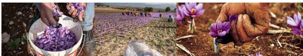
Figure 2. Saffron harvesting.

The cultivation process includes harvesting the flowers, as presented in Figure 2, splitting the stigmas and stamens from the petals, drying and sorting of saffron. The picking of 1000 flowers is process of a duration around 45–55 min, while additional 100 to 130 min are required for removing the stigmas for drying. In total, 370 to 470 h are required to produce 1 kg of dried saffron [52]. The flowers are picked exactly when they are fully bloomed, and the saffron strand or stigma is at its reddest. The harvesting process begins shortly after dawn to minimize the further sunlight exposure to the crops, since they may lose their color and even flavor. Saffron cultivation requires dry soil with specific levels of moisture, controlled irrigation and right amounts of nitrogen, phosphorus and potassium. Cultivation is commonly disturbed by mice, moles and rats wrecking the stems. Furthermore, fungi may cause specific diseases at the early stages of saffron growth.