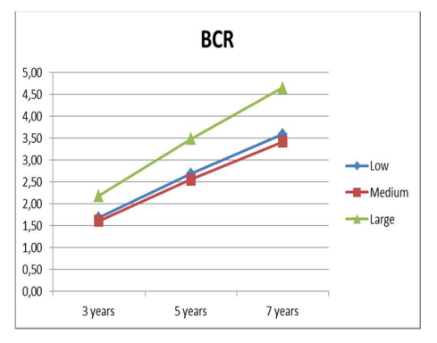
Figure 10. Benefit / Cost Ratio

The values of the three formulas are presented visually in figures 10, 11 and 12 below for every case study and time depth: