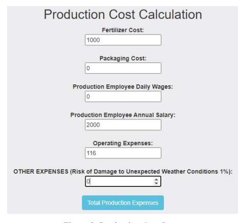
Figure 8. Production Cost Input

Next we enter the farmer's yearly expenses and pressing the "Total production expenses button" will give as 3.116 amount: