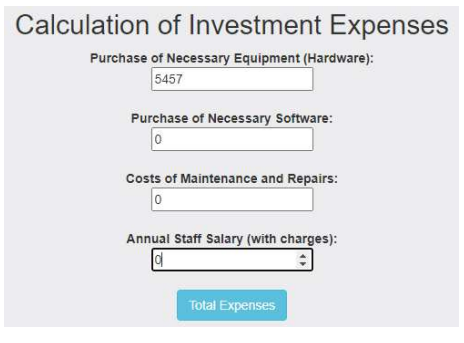
Figure 7. Investment Expenses Input

We begin with the 3 year time frame by inserting the buying cost of the hardware (5.457 €) and 0 € for the next fields. So the "Total expenses" button will give as the 5.457 € amount.