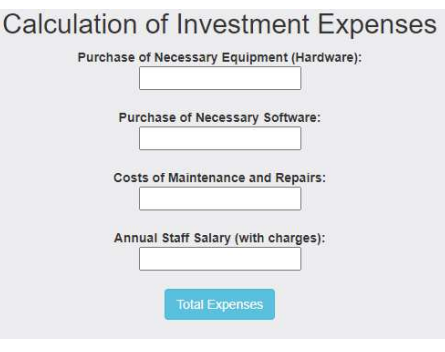
Figure 1. Investment Expenses Calculation

In the home page of the website the user is required to insert the investment and annual expenses and the tool prints the total amounts.