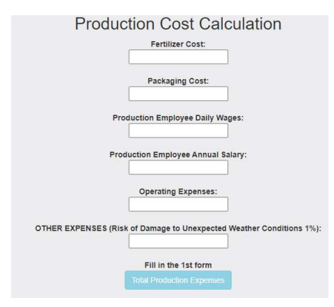
Figure 2. Production Cost Calculation

There is a static menu on the top with links for the calculation of the three formulas, return to home page and about page.